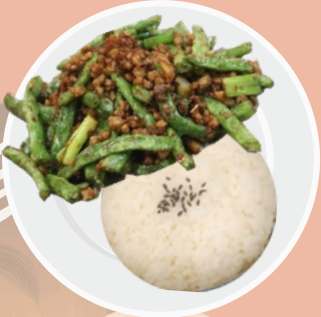
STIR FRY STRING BEAN WITH MINCED PORK