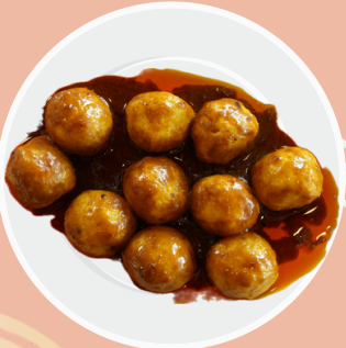
CURRY FISH BALLS