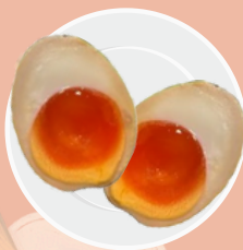
加$2: 溏心蛋 (一只)