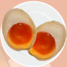
$2 EXTRA: SOFT BOILED EGG (1)