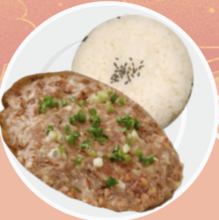
STEAMED MINCED PORK WITH PRESERVED VEGETABLES