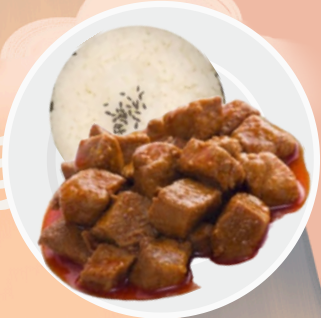
SPICED PORK CUBE